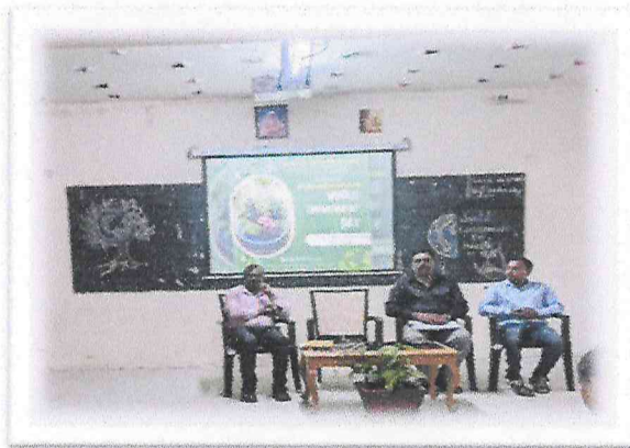
Faculties on the Diaz